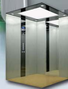
Home Lift Lorong Sarina