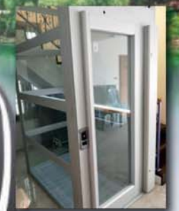
Platform Lift Li Huan View