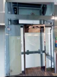
Home Lift Jalan Arif