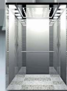
Home Lift Joo Chiat Avenue