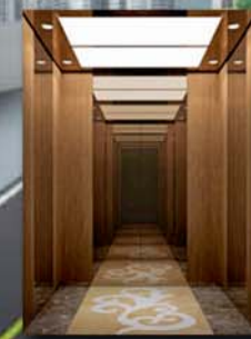
Home Lift Chwee Chian Road